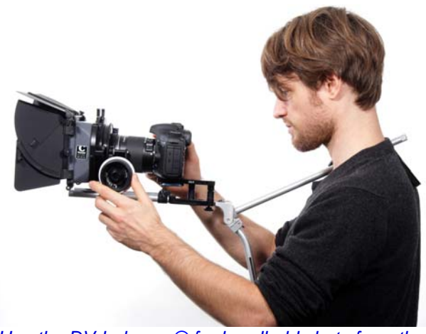
Use the DV-balancer® for handheld shots from the shoulder. It fits directly on the light weight support.