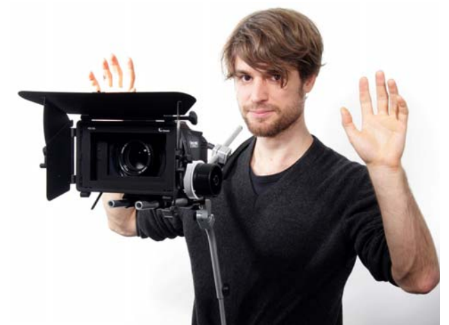
The shoulder support very easily positions to allow perfect adjustment of the DV-Balancer®.